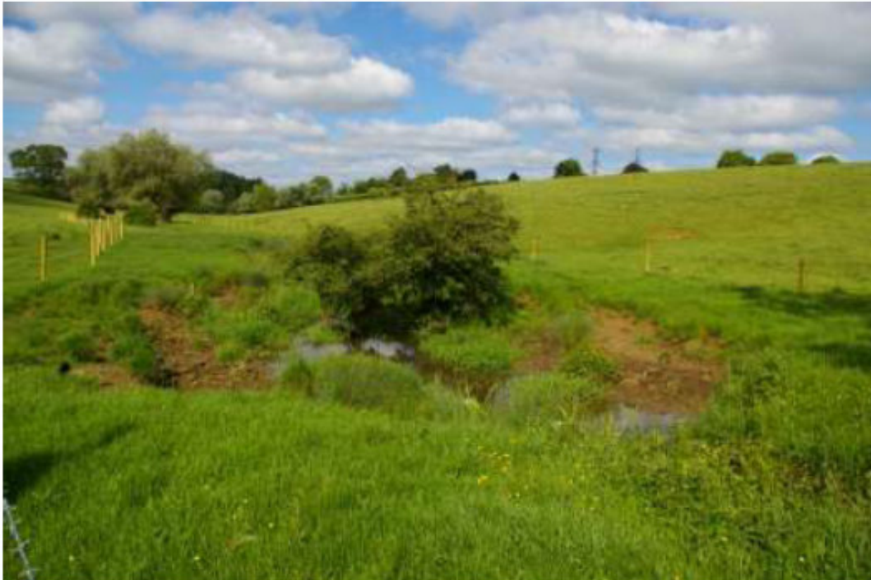
Poached area of the Swanspool Brook at Wilby in March 2010