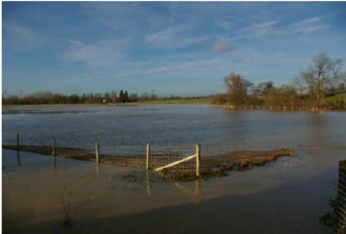
Flooded 7ha field on the River Nene at Upper Heyford in March 2008