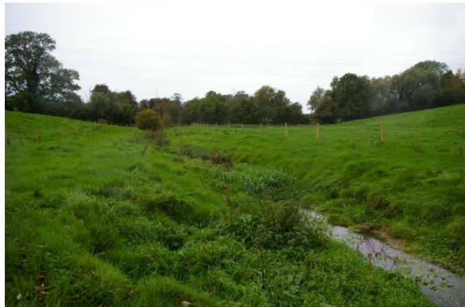
Recovered cattle drinking area

The project will continue to offer farmers help and advice on a 1-1 basis as well as offering a series of events across the catchment area. If you are interested in receiving a free visit please contact RNRP using the contact details at the end of the newsletter.