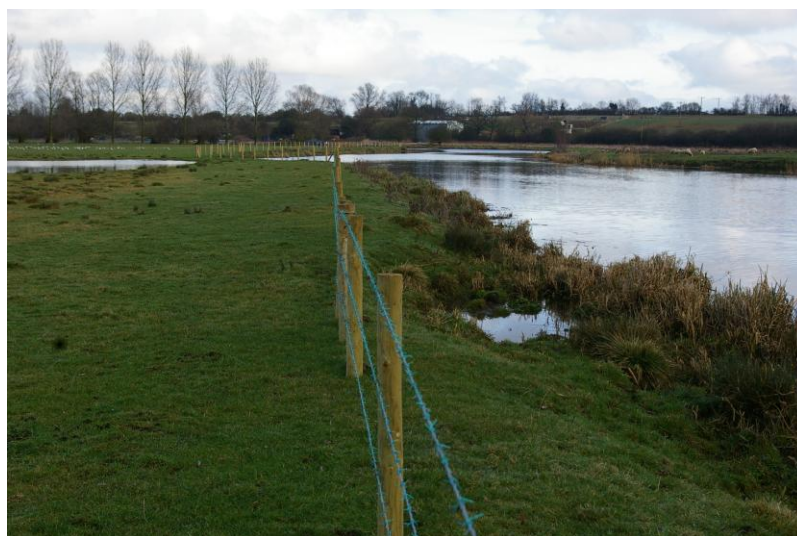
Fenced off river to protect from poaching